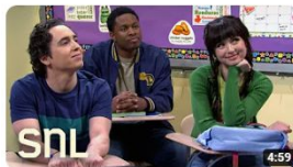
Spanish Class - SNL