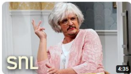
Protective Mom - SNL

A comedic take on popular content at the time - song, films, shows, events/news, etc