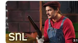
HBO Mario Kart Trailer - SNL