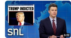
Weekend Update: Donald Trump Indicted - SNL