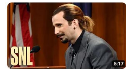
Johnny Depp and Amber Heard Trial Cold Open - SNL