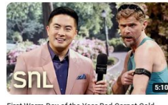
First Warm Day of the Year Red Carpet Open - SNL