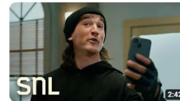
BeReal - SNL